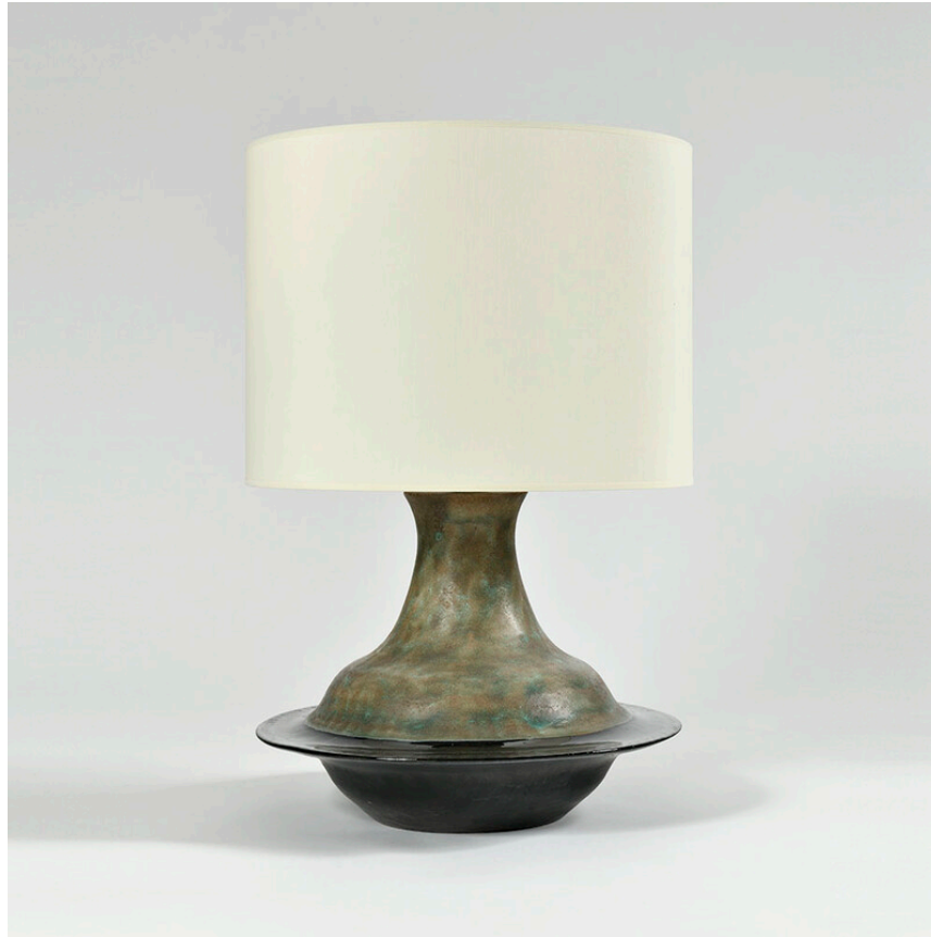
Extra Large Ceramic Table Lamp Spinning Shape Bruno Gambone