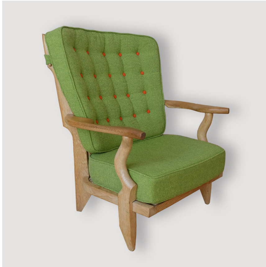
Guillerme Et Chambron Grand Repos Madame Armchair