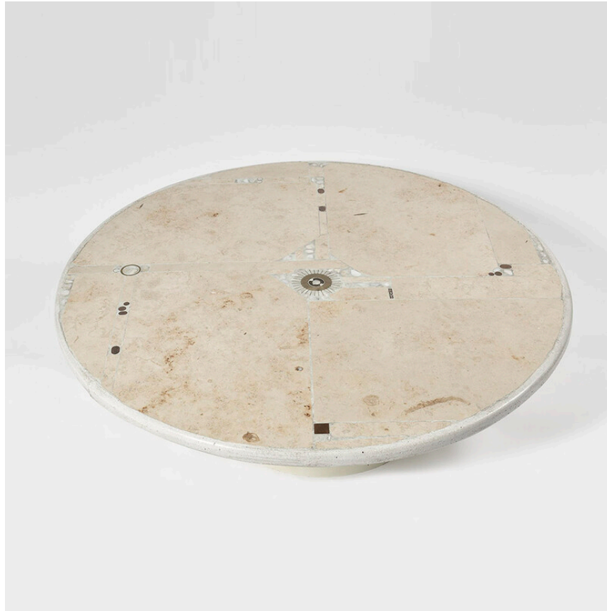
A Huge Travertine White Concrete Paul Kingma Coffee Table